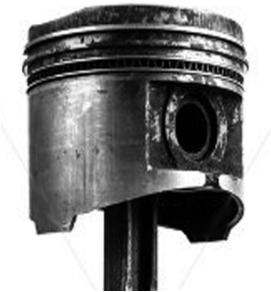
Worn & dirty piston without UPOIL P 1000