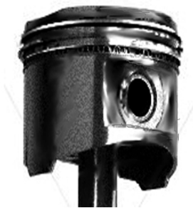
Good condition piston with UPOIL P 1000